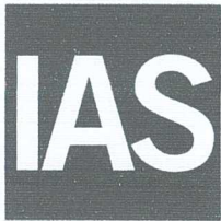
King Cert International Certification Ltd. Director

ACCREDITED Management Systems Certification Body MSCB-196